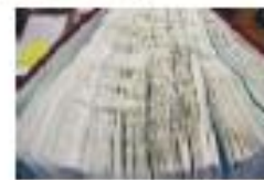
(left): At one of Polygon's regional document recovery centers, your damaged documents will be inventoried, then dried and cleaned, returning them to a usable condition. (top): Polygon staff of trained professionals will manage your project using the most advanced techniques available, such as the vacuum freeze dry chamber shown here. (above): The same text book before and after drying and mold remediation.

Polygon 79 Monroe Street, PO Box 640, Amesbury, MA 01913-0640 Tel: 1-800-422-8379 Fax: 978-241-1274 www.polygongroup.us